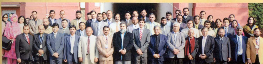
The Islamia University of Bahawalpur