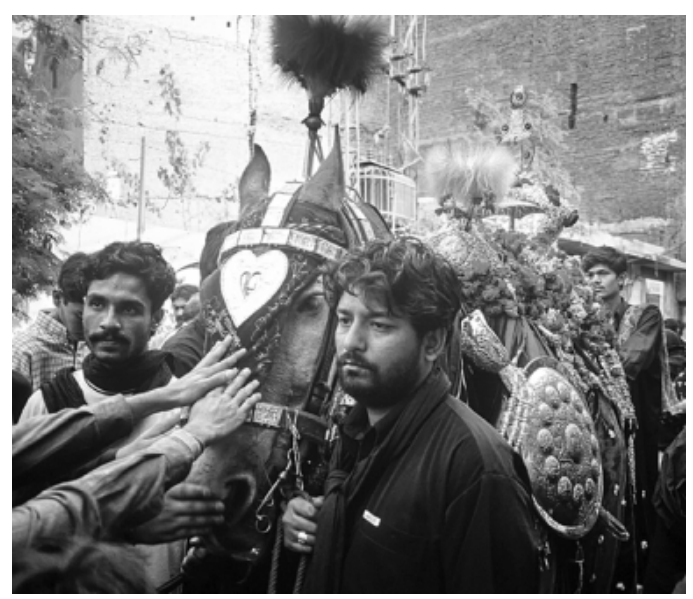
Horse of Karbala" procession, Heera Mandi district, Lahore, during the 2002 Muharram season. Bystanders touch the horse as it passes to honor the Imam Husain and the other Karbala Martyrs. Garlands of flowers are placed atop the saddle as an act of veneration

Most Sunnis I interviewed in Lahore voiced disapproval of zanjiri matam , claiming that it violates Islamic norms of self-restraint and decorum. But